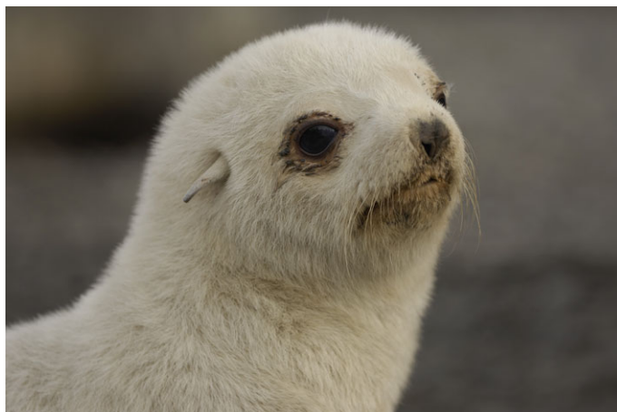
Figure 2. Phaeomelanic Antarctic fur seal pup.

phenotype, which is the result of reduced melanin production [27]. Until recently, hypo-pigmented fur seals had only been observed at South Georgia, where their relatively high frequency (one in 600–1400 individuals) is thought to have resulted from a strong historical bottleneck [15,28]. However, phaeomelanic adults have now been sighted at the nearby South Shetland Islands [29–31] as well as at Bouvetøya [32] and Marion Island [25,26], where the first confirmed birth of a hypo-pigmented pup outside of the Scotia Arc was also recently reported [25]. These observations have been interpreted as providing evidence that individuals from South Georgia (or other populations in the Scotia Arc) emigrated to Marion Island carrying with them the allele responsible for hypo-pigmentation [25,26].